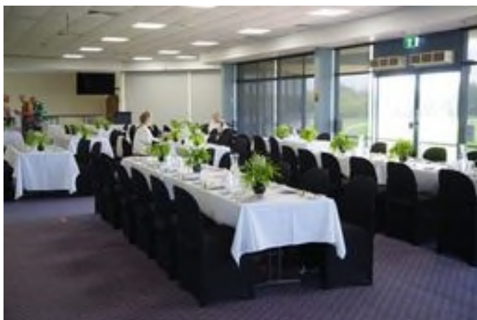
Tables layout at the Ballina Jockey Club