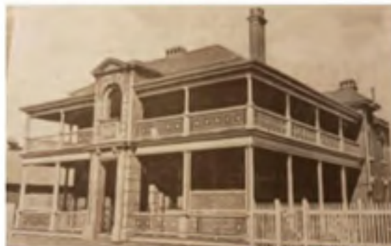
The former Commercial Banking Co Murwillumbah