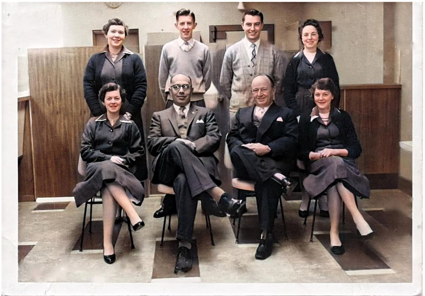
Fairfield staff 1960