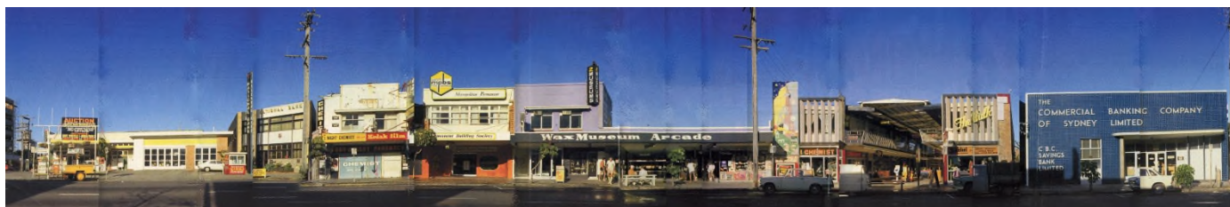
Main Street, SURFERS PARADISE in 1974 with CBC Bank, the blue building on the right.