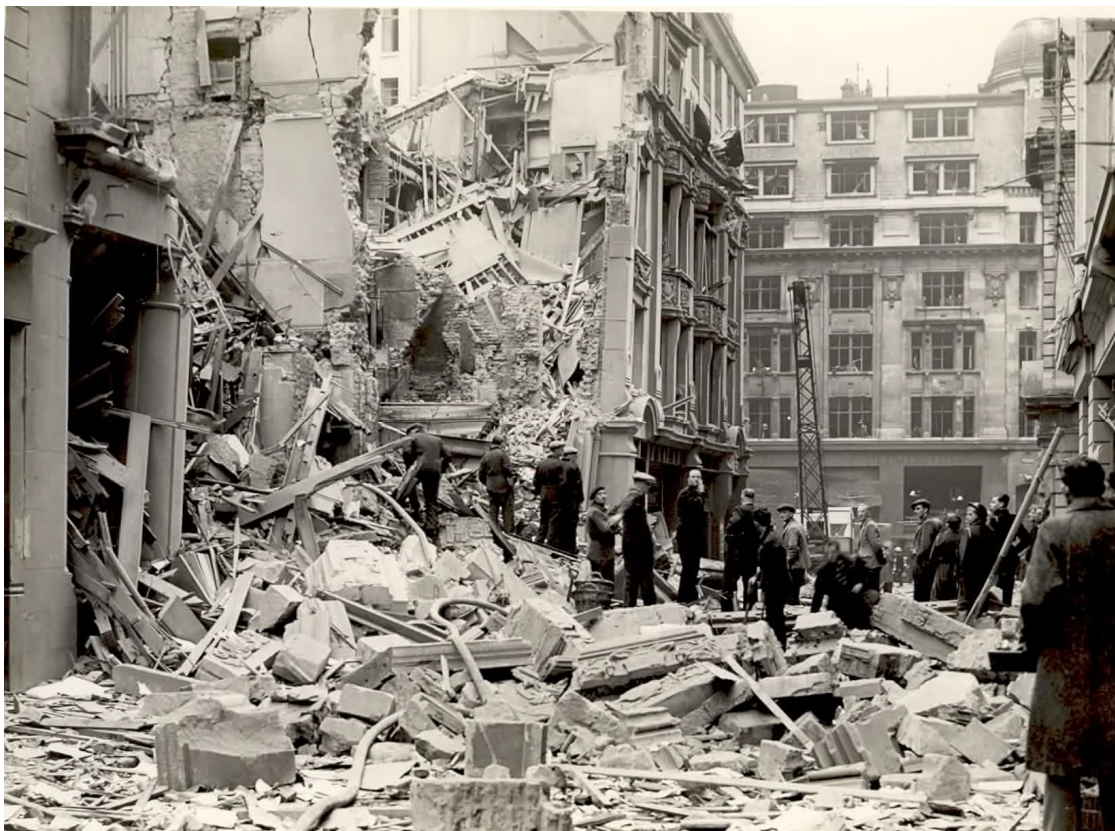
Old Jewry site after WW2 bombing and before building London Office.

Ed. Les's Service history is on the website.