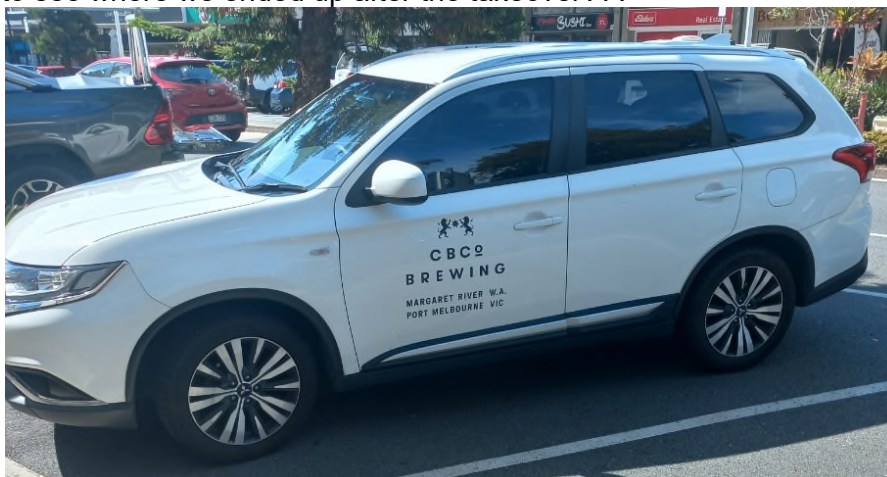
Photographed in Coolangatta

There was a time when we were called the CBCo. (probably when we were Juniors doing the Exchanges!!!) So it is interesting to see where we ended up after the takeover???